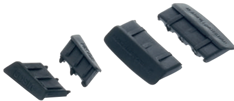
074504 Caps for visor and ear protection slots for all Ares series helmets (2+2 pcs).