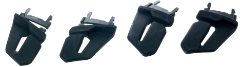
074503 Replacement headlamp holder clips for all Ares series helmets (4 pcs).