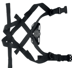
074508 Replacement chin strap kit for Ares Air, Ares Air Plus.