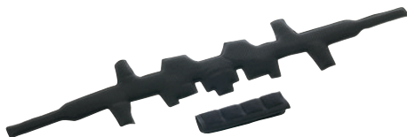
074506 Replacement mesh padding kit for all Ares series helmets (except Ares MIPS).