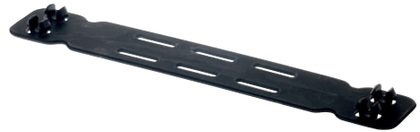
074505 Adapter kit for reducing the size for all Ares series helmets (except Ares MIPS).