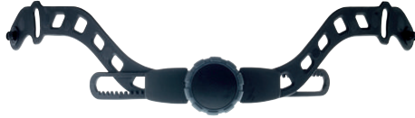
074501 Replacement turn dial adjustment kit for all Ares series helmets.